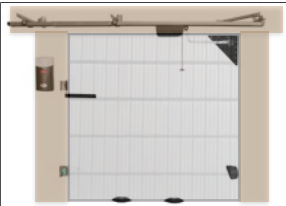
Opens LEFT when viewed from inside.

Includes: 1 Pro 1000 plug 'n play controller/wall station, 2 motors with drive track, 2 cinchers, pre-wired reflective photocell, door guides, 1 wireless wall station, 2 four-button remote controls, and all mounting hardware.