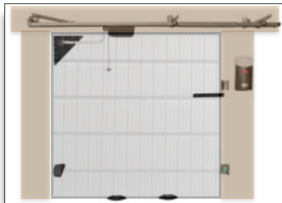
Opens RIGHT when viewed from inside.